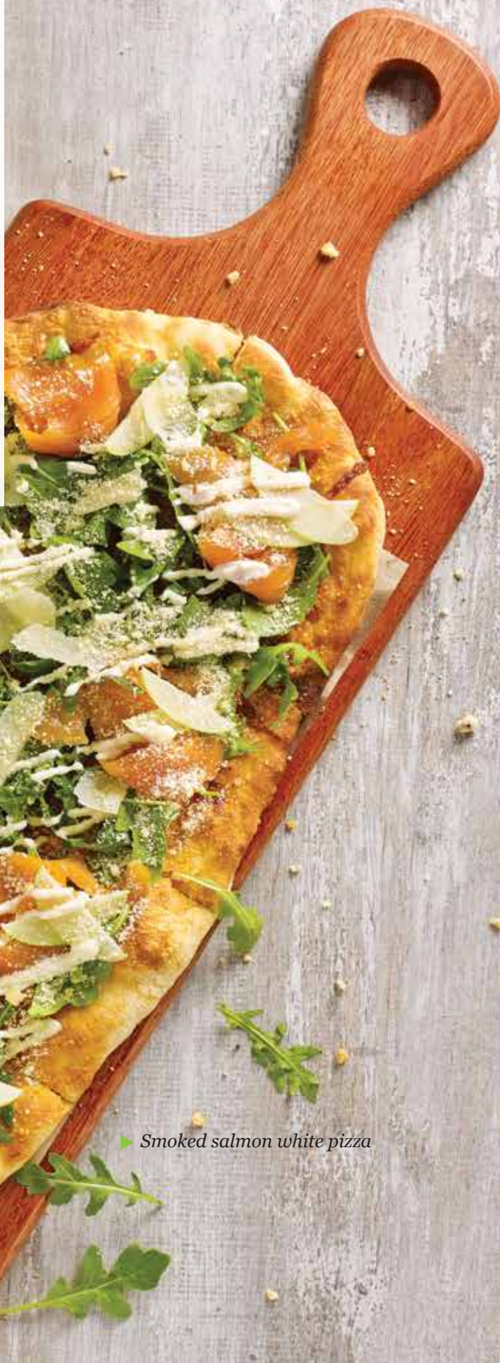
► Smoked salmon white pizza

All prices subject to 10% service charge and prevailing GST.