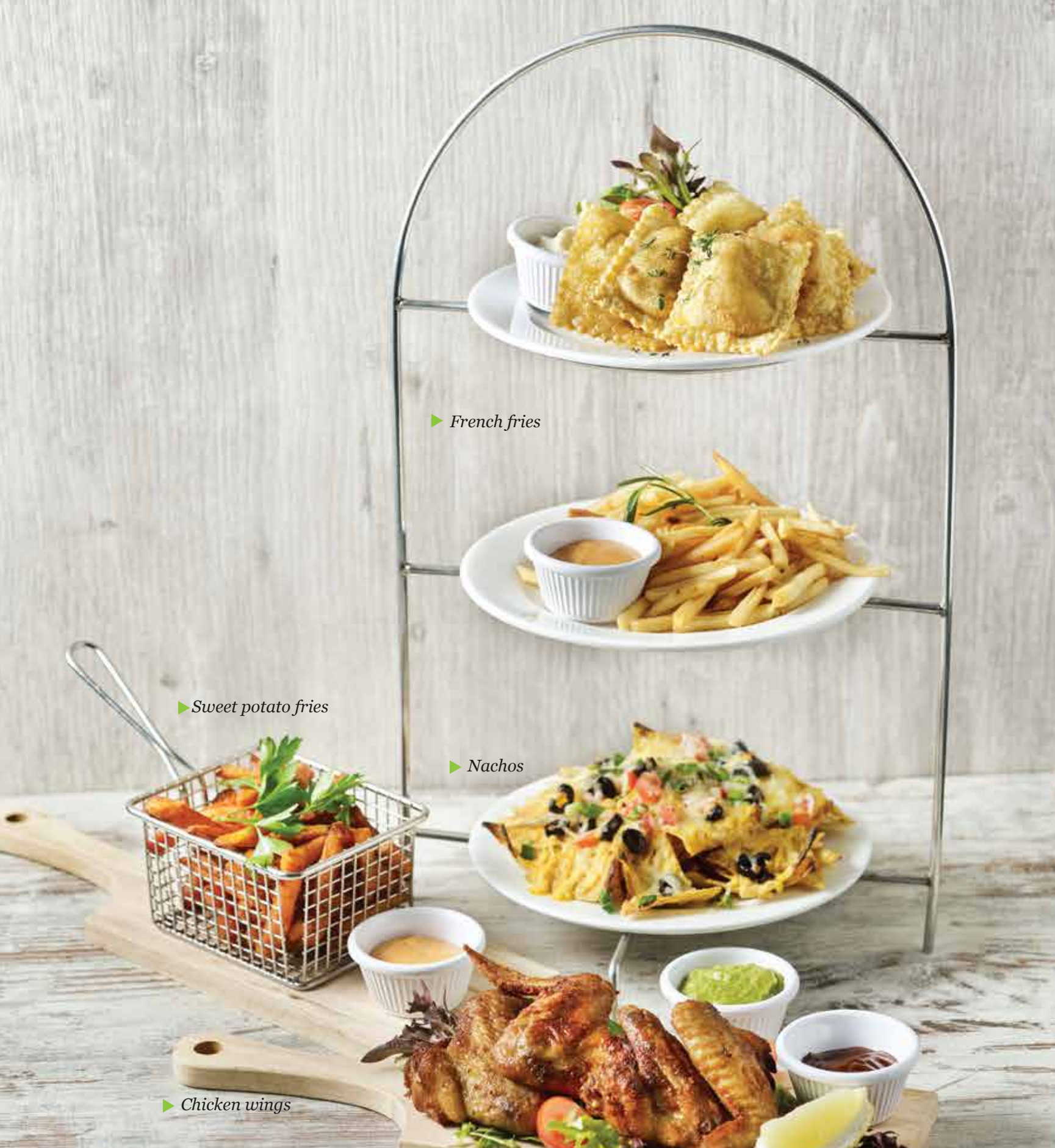
► French fries