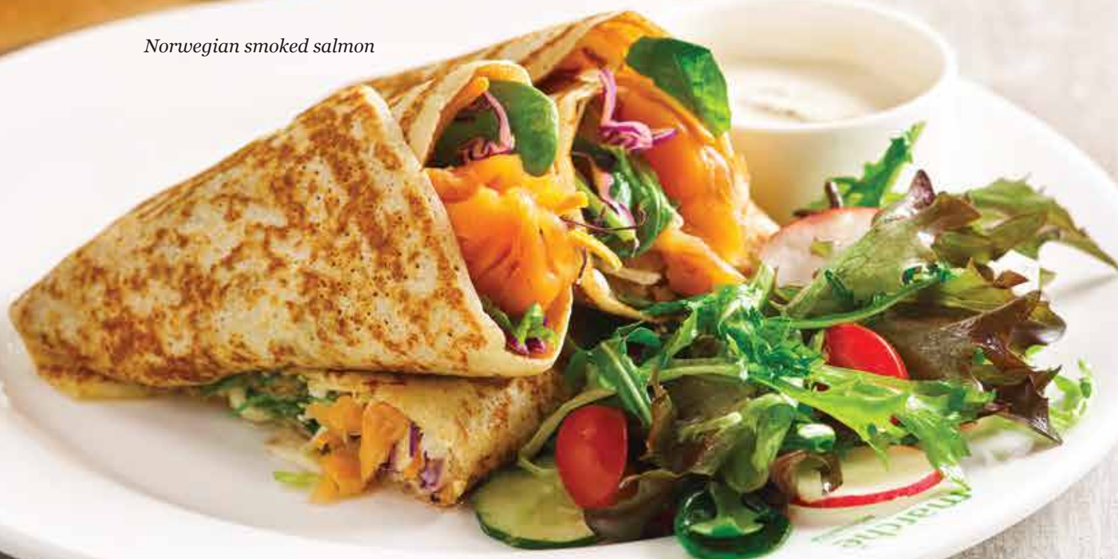
Norwegian smoked salmon

All savoury crêpes are served with mixed greens and homemade cream sauce