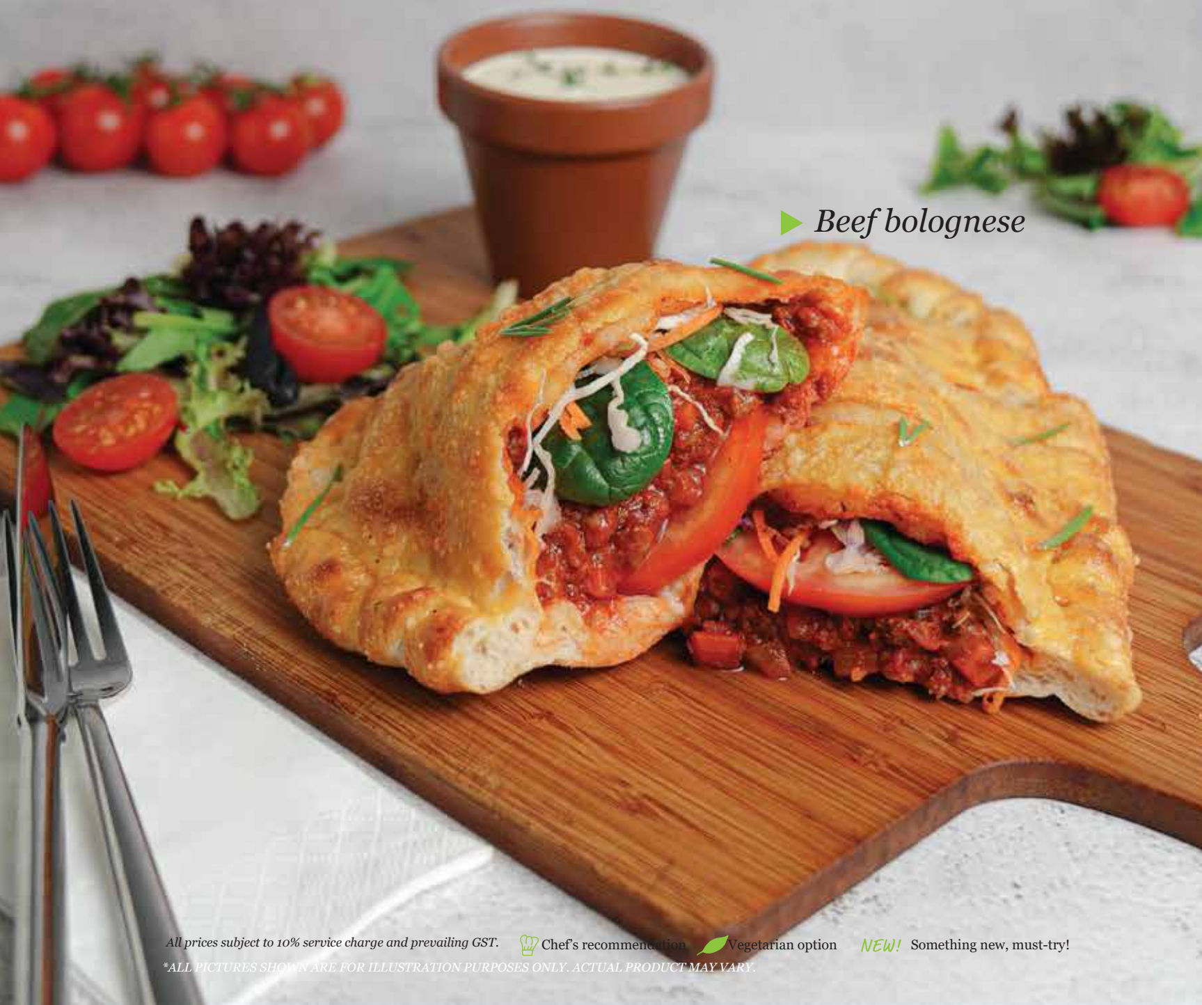
► Beef bolognese

All prices subject to 10% service charge and prevailing GST.