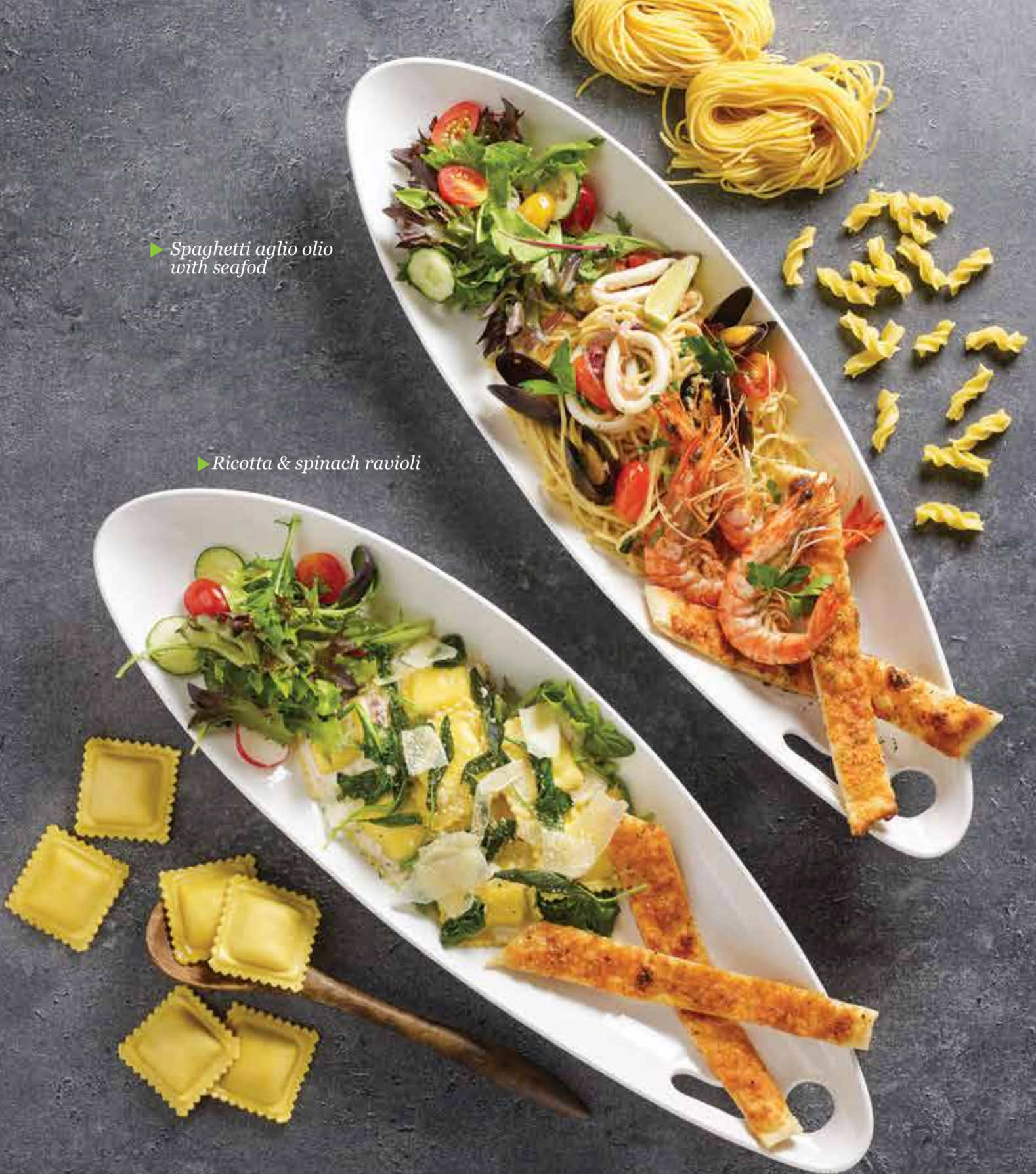
▶ Ricotta & spinach ravioli