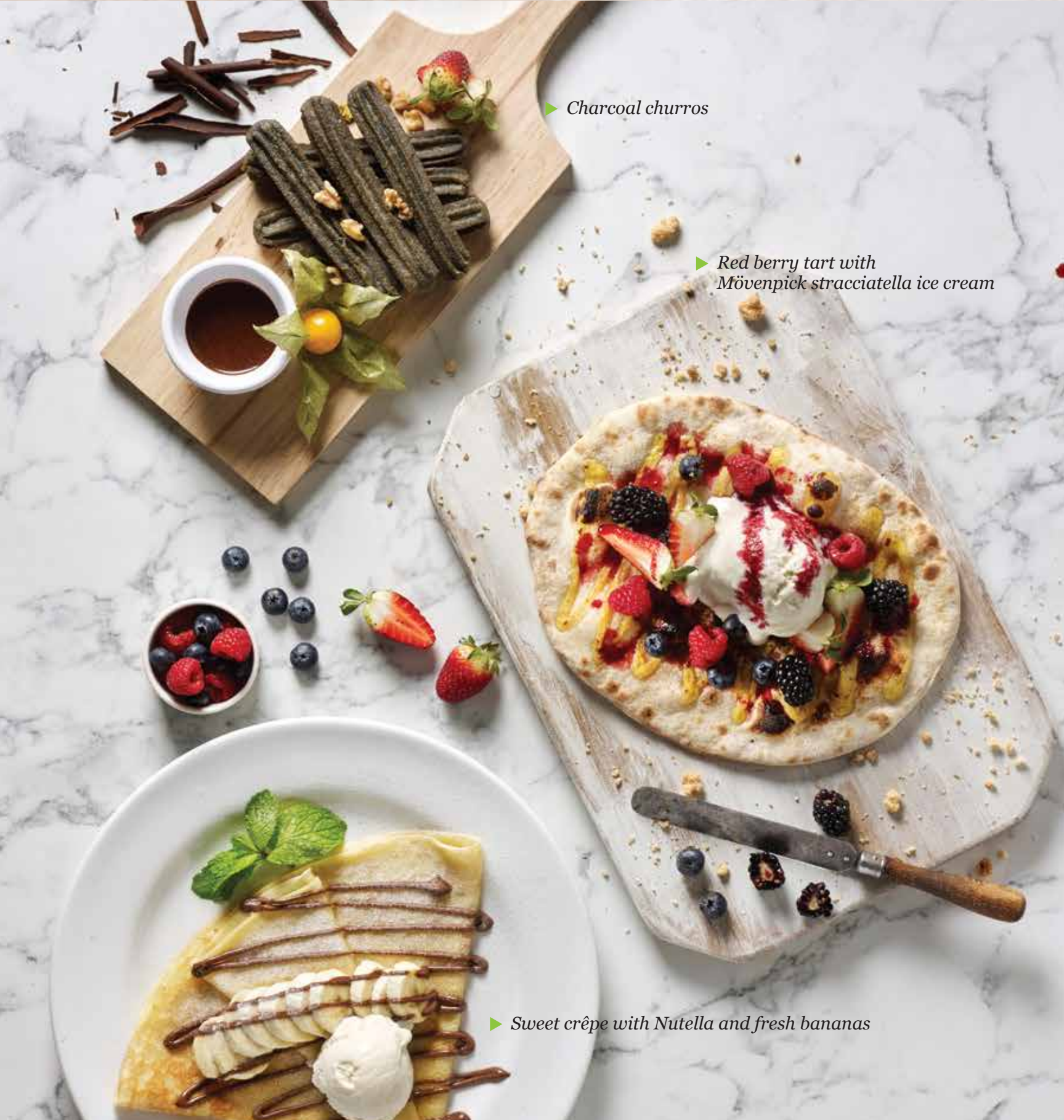
► Charcoal churros