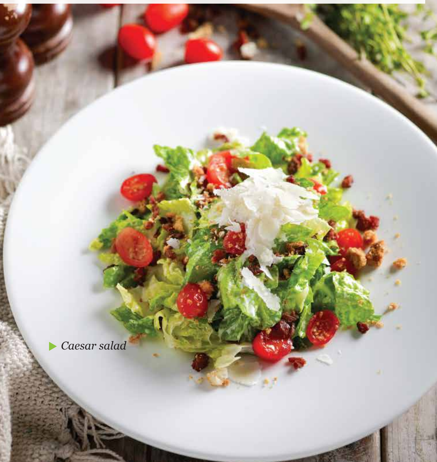
► Caesar salad

mixed greens with roasted chicken breast, carrots, cucumbers, pine nuts and balsamic dressing